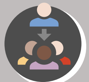
Prioritize the rights of others