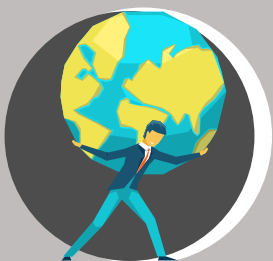
Develop your character

Clarifying your ethical vision in this way can help you: develop your character, evaluate consequences, and prioritize the rights of others.